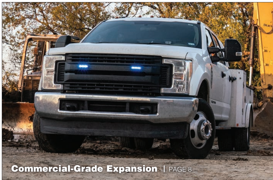
Commercial-Grade Expansion | PAGE 8