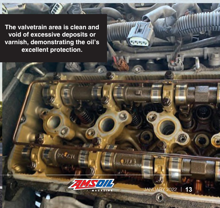
The valvetrain area is clean and void of excessive deposits or varnish, demonstrating the oil's excellent protection.