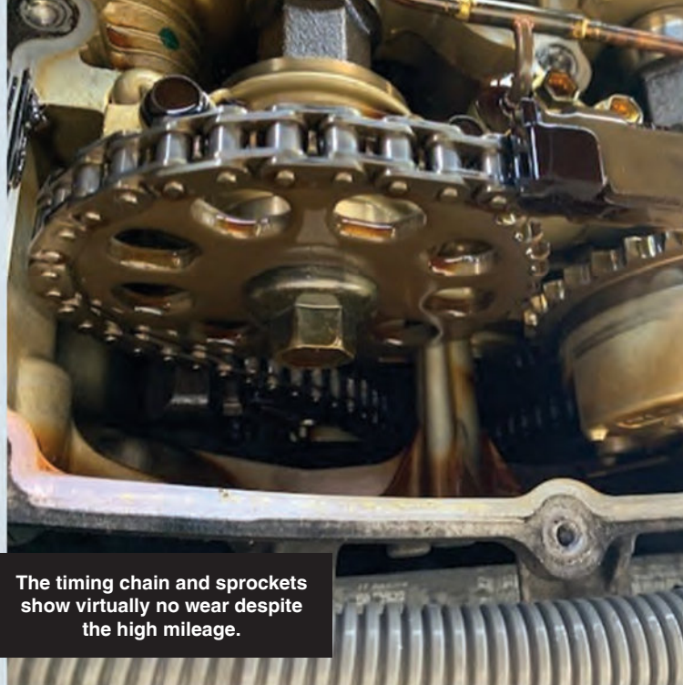
The timing chain and sprockets show virtually no wear despite the high mileage.